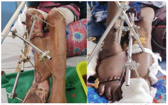
Figure 1: Post-operative pictures of well settled flap.